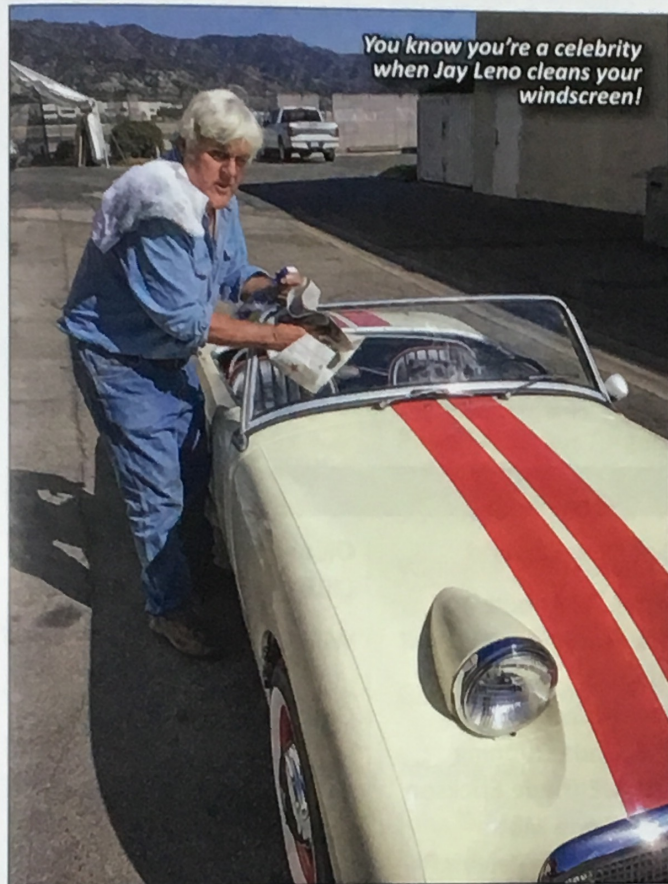
You know you're a celebrity when Jay Leno cleans your windscreen!

In addition to the official Trump "First Family," we have a reality First Family ... the Kardashians. And it turns out, one former member is a Healey owner, too. Bruce Jenner thought his first car was going to be an Austin-Healey when his Dad taught him how to drive in Tarrytown, New York, in a grocery store parking lot: "I was 15, turning 15, and he had a little Austin-Healey 'Bugeye' Sprite. It was red with white