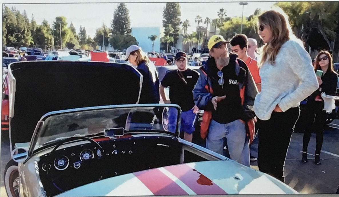
Caitlyn and "Dad's Sprite" at a car show.